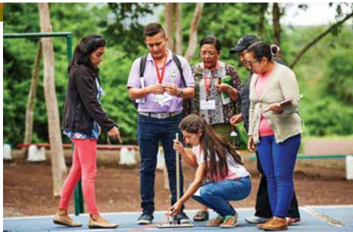
Teachers practice a hands-on rocket-launching science activity during the recent Teacher Institute in Galapagos.

Immediately following each Institute, and throughout the year, "instructional coaches" work with teachers in their classrooms. As the job title would suggest, coaches are educators trained to observe teachers and to guide their professional growth. A coaching session begins with a meeting between coach and teacher to discuss a lesson to be delivered, and the coach then observes the teacher delivering that lesson. The classroom observation is followed by a meeting during which the coach helps the teacher to reflect on their practice.