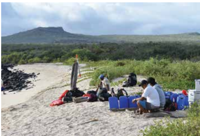
Rangers set up camp on Española Island. The highlands where the tortoises live are shown in the background.