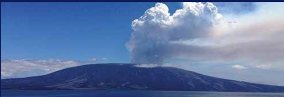
La Cumbre Volcano on Fernandina Island erupted on September 4, 2017.