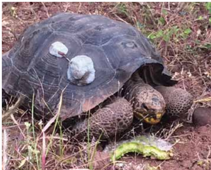
A tortoise showing off his satellite tracking devices on Santa Fe