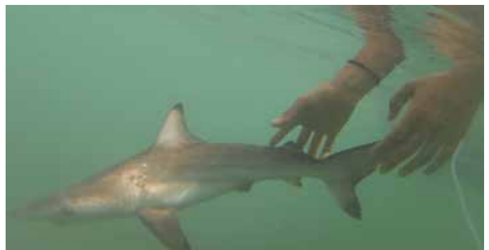
Bottom: A juvenile blacktip shark is released back into the ocean after being measured for research.