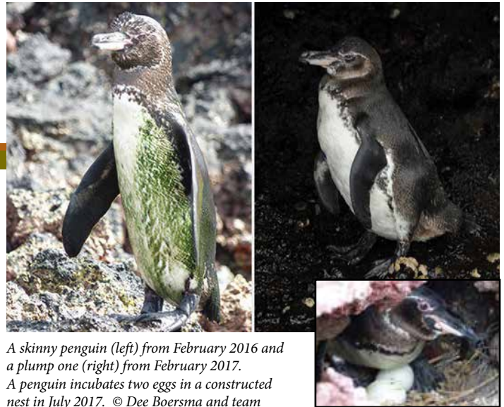
A skinny penguin (left) from February 2016 and a plump one (right) from February 2017. A penguin incubates two eggs in a constructed nest in July 2017.

In early July 2017, we set off aboard Godfrey's ship, RATTY , for Bartolomé, Isabela, and Fernandina Islands to see what the penguins were up to. We hoped to see more juveniles, a good indication of successful breeding over the last six months. We