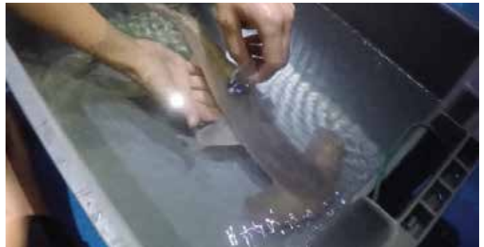
Top: Tagging a juvenile hammerhead shark for the first time to determine the movement patterns of these vulnerable animals.