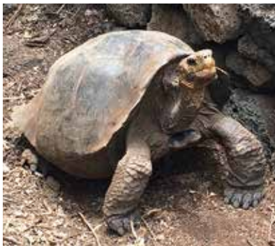
A tortoise in the new Floreana breeding program.