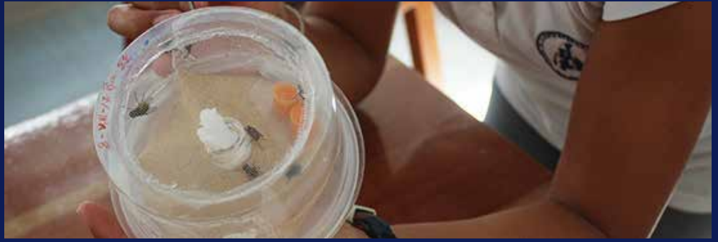
Philornis downsi flies in the CDRS lab

The Galapagos Conservancy blog is full of engaging conservation stories from many contributors in and outside the Islands. Here, we share with you a few excerpts from recent posts. Full stories can be found online at: