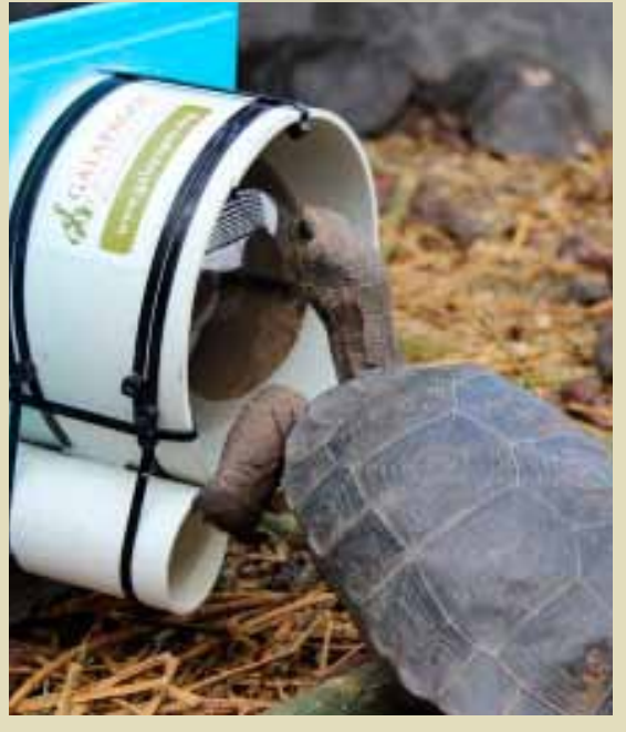
One of the young tortoises at the tortoise center on Santa Cruz goes in for a close-up inspection of the webcam installed in his pen.

Web cameras are fast becoming a standard tool to engage the public in species protection and awareness. With start-up funding from Dr. Jim Gallagher of New Jersey, a long-time donor and friend to Galapagos, a series of four "tortoisecams" and supporting web delivery systems were installed at the tortoise breeding pens of the Galapagos National Park Directorate Tortoise Center on Santa Cruz. With the webcams running continuously, uploads are sent daily to a remote server and then combined into one continuous streaming video that shows the highlights from all four cameras from the previous day. Footage is streamed on www.galapagos.org, where an interactive component allows interested observers to "chat" and comment on the footage. With the successful launch of these webcams, after overcoming the various technological hurdles that come with working in such an isolated place as the Galapagos Islands, we anticipate using more of these integrated systems to engage visitors and residents in the daily conservation efforts in Galapagos.