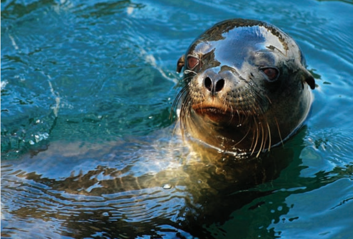
Tourists and residents of Galapagos can play a crucial role in conservation by sharing their observations about the health of native species. Such observations have led to recent in-depth investigations of both Vermilion Flycatchers and Galapagos Sea Lions to determine whether their populations are truly declining and why.